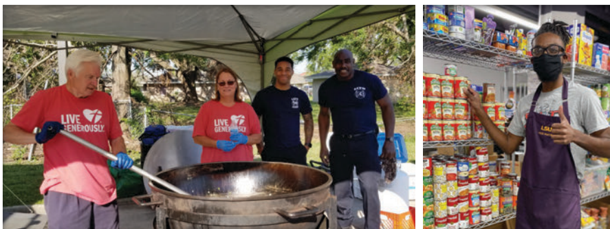
Forged by Fire (left) and LSU Food Pantry (right)