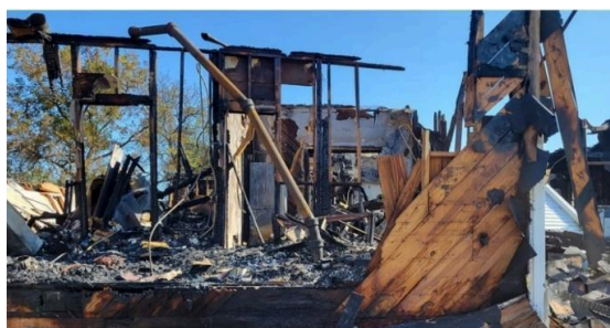
Epiphany Lutheran Church in Jackson, Miss., was destroyed by arson on Nov. 8. The church is the oldest, historically black church in Mississippi.