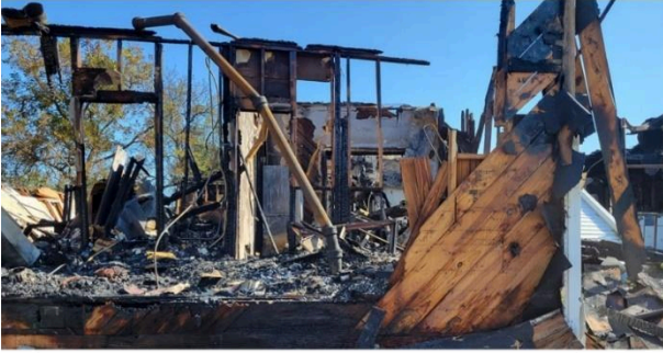
Epiphany Lutheran Church in Jackson, Miss., was destroyed by arson on Nov. 8. The church is the oldest, historically black church in Mississippi.

items for their altar. Epiphany was attacked by an arsonist in 2022.